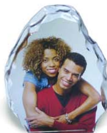
Spear Iceberg 4.7"H X 4.5"W