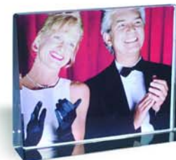
Horizontal Incline 2.4"H X 3.2"W