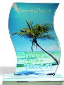
S Shaped 7.1"H X 5.3"W