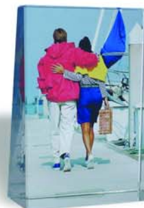
Vertical Incline 3.2"H X 2.4"W