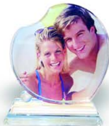
Heart 3.9"H X 3.9"W