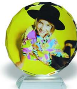
Sunflower 3.2"H X 3.2"W