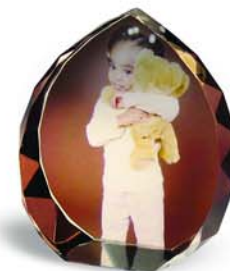
Arrowhead 3.5"H X 3.2"W