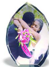
Tear Drop 4.7"H X 3.3"W