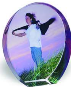
Moon Door 4.3"H X 4.3"W

Send the completed form on this brochure, along with your photo and payment, to the address indicated. Be sure to include your phone number.